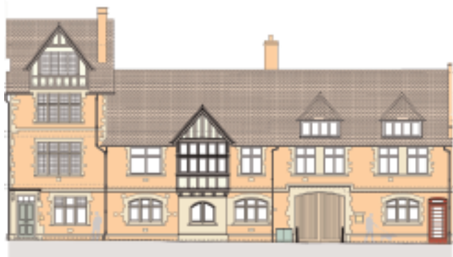
Our new home in Pembroke Street - much work needs to be done before we can move in.

A generous gift of £2.5m from an anonymous fairy godmother enabled us to buy the lease on the property. But this is only the first chapter: we shall need to raise a further £11m to open the Museum by 2014 when Oxford aims to be UNESCO World Book Capital City. We'll send you more instalments as this exciting story unfolds.